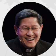
Cardinal Luis Antonio Tagle

'Many parishes in the Archdiocese of Detroit have found Alpha a great tool for helping men and women hear the initial proclamation of the gospel. I am pleased that our use of Alpha with the archdiocesan staff has invited a recommitment to the basic truths of the gospel.'